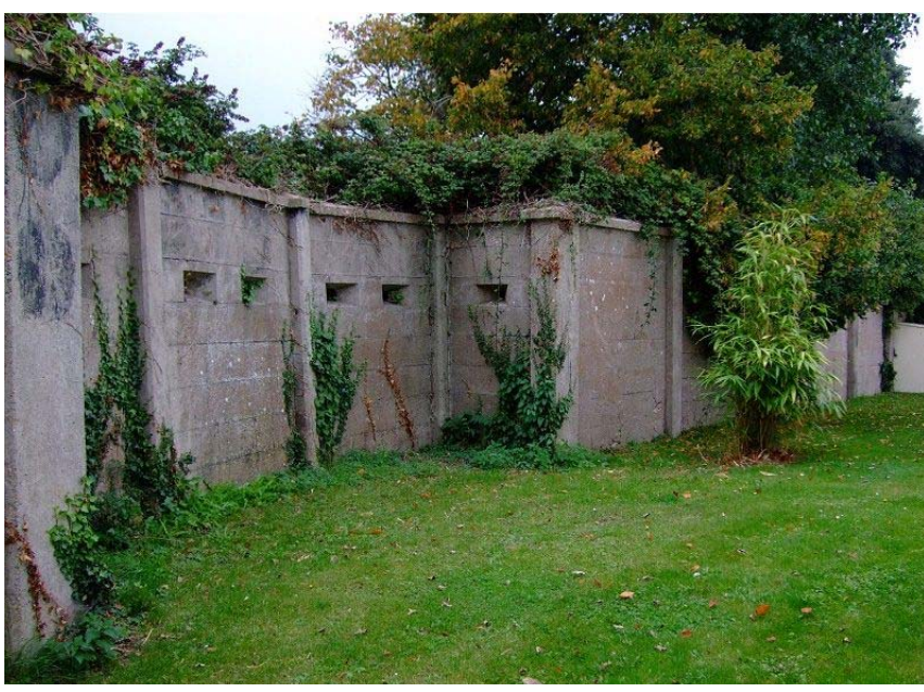
The ferro-concrete wall