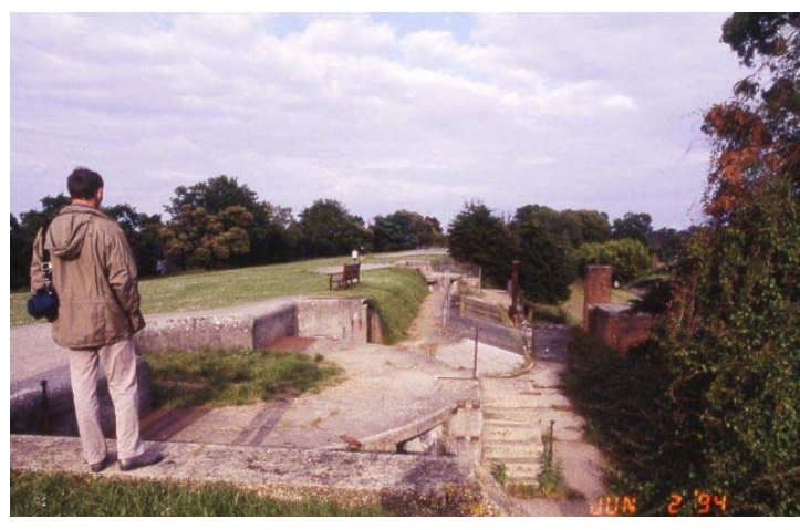
6-inch B.L. emplacement